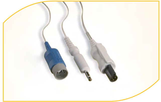
AccuTemp Disposable Temperature Probes