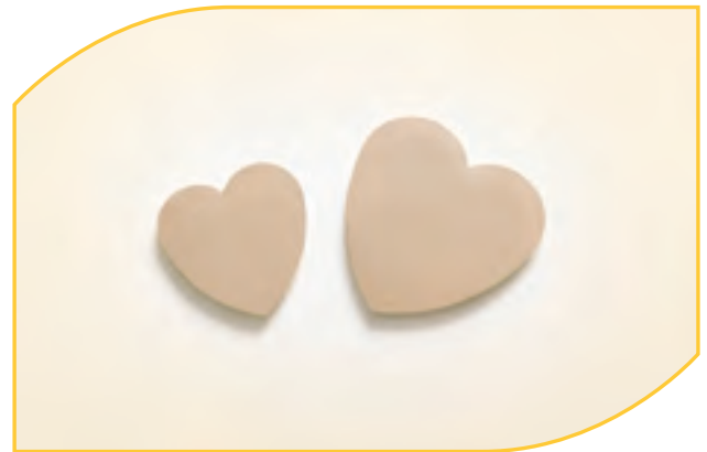
AccuTemp Plus Insulated Hydrogel Probe Covers