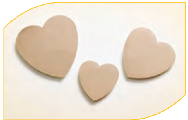
AccuTemp Insulated Acrylic Probe Covers